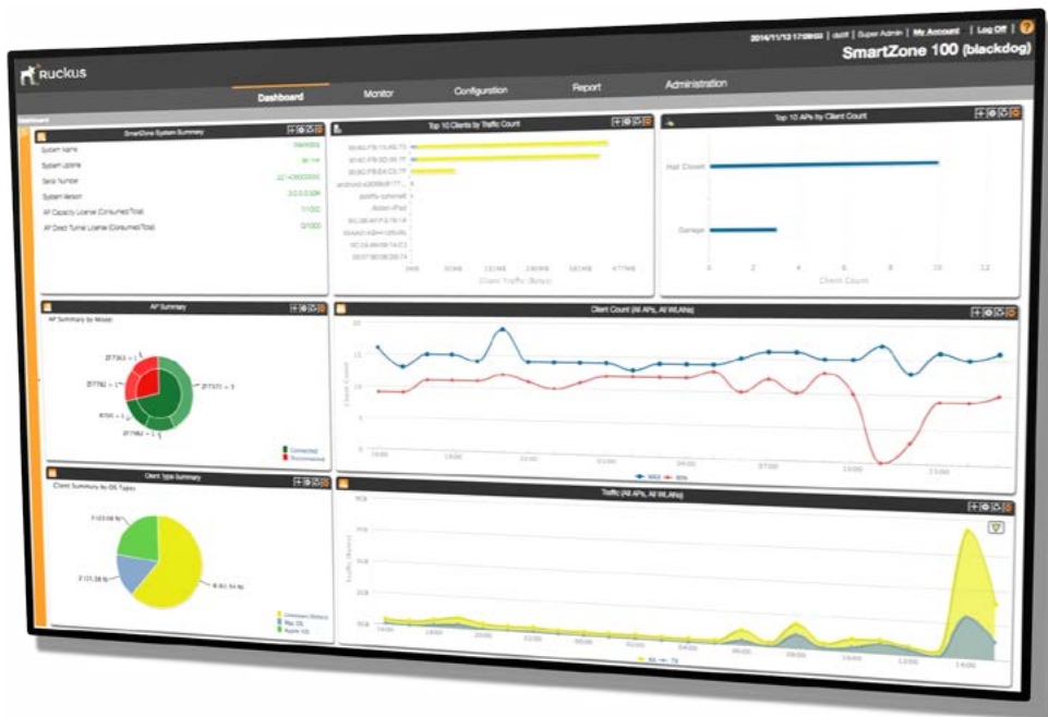
Below: The SmartZone 100 per user customizable dashboard

Ruckus Smart Mesh Networking enables self-organizing and self-healing WLAN deployment. It eliminates the need to run Ethernet cables to every AP, allowing administrators to simply plug in ZoneFlex APs to any power source and walk away. All configuration and management is delivered through the SmartZone™ 100 Smart WLAN controller. APs can also be daisy-chained to mesh APs to extend the mesh and take advantage of spatial reuse.